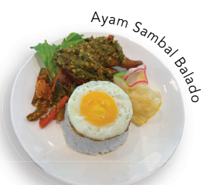
Ayam Sambal Balado