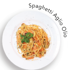
Spaghetti Aglio Olio

With Black Pepper Sauce, Mashed Potatoes & Vegetables