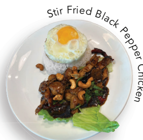
Stir Fried Black Pepper Chicken