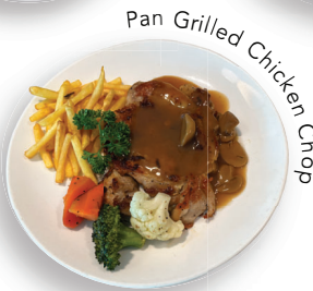
Pan Grilled Chicken Chop