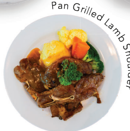
Pan Grilled Lamb Shoulder