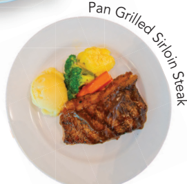
Pan Grilled Sirloin Steak